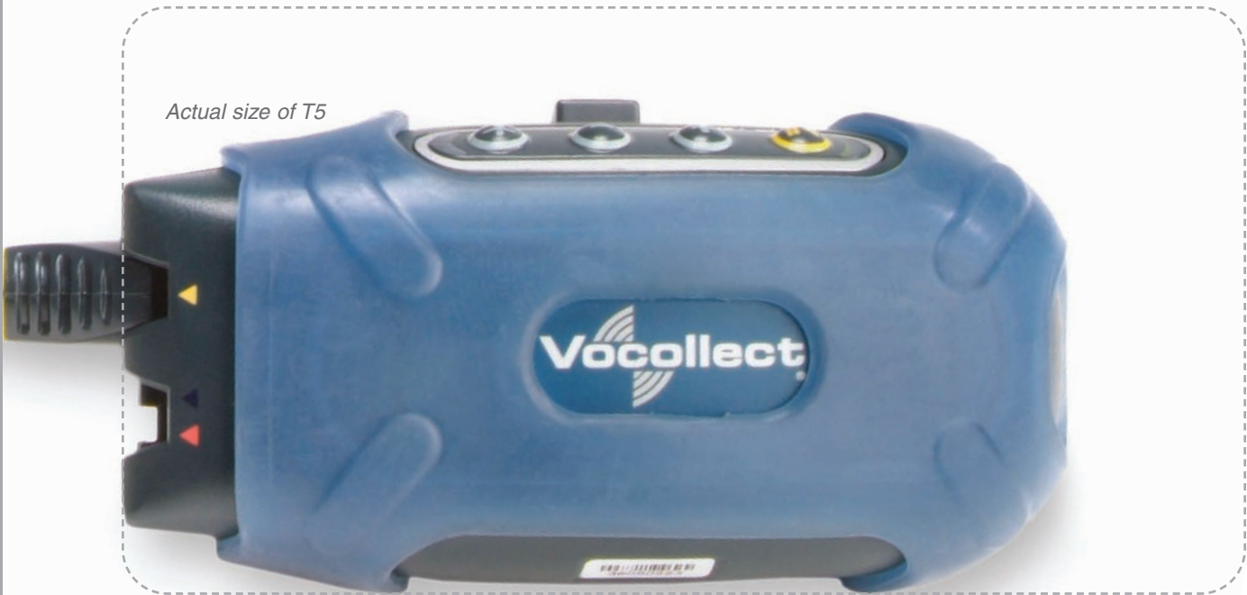
The T5 Wearable Computer: 33% smaller and 45% lighter than the T2x